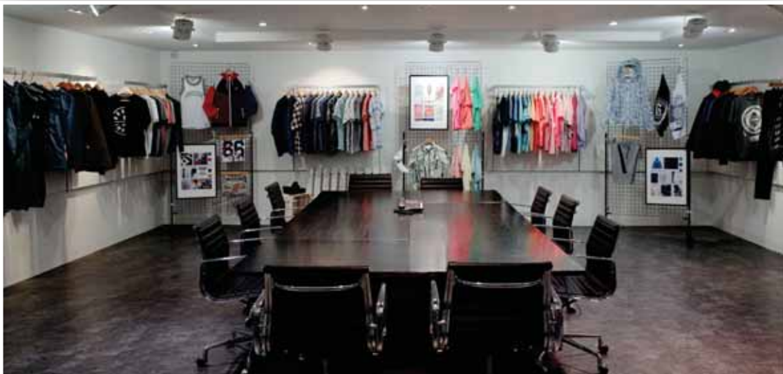
Product Design & Show room